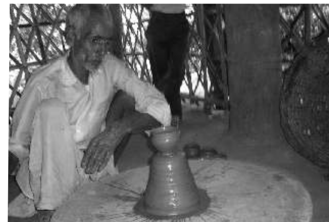
An elderly potter works hard at the wheel in Kalagram, a place for artists, constructed to support the livelihood of local aged artisans at the Vishokanand Vriddh Ashram in Ganj, Bijnor (UP).

The Vishokanand Vriddh Ashram is a unique haven for the aged of Bijnor (UP). Run by HelpAge, it caters to multiple needs of the elderly of Bijnor, by providing healthcare through its Rural Health Centre for the aged, based on the traditional system of Indian medicines viz. Ayurveda, Homeopathy & Naturopathy. It also provides Physiotherapy and Livelihood opportunities, along with helping them fulfill some of their long cherished dreams of travel by organizing tours to places of worship and of historical significance.