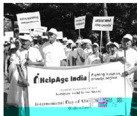
Senior citizens march together in step to drive home the point of the importance of healthy ageing in Kottayam (Kerala).