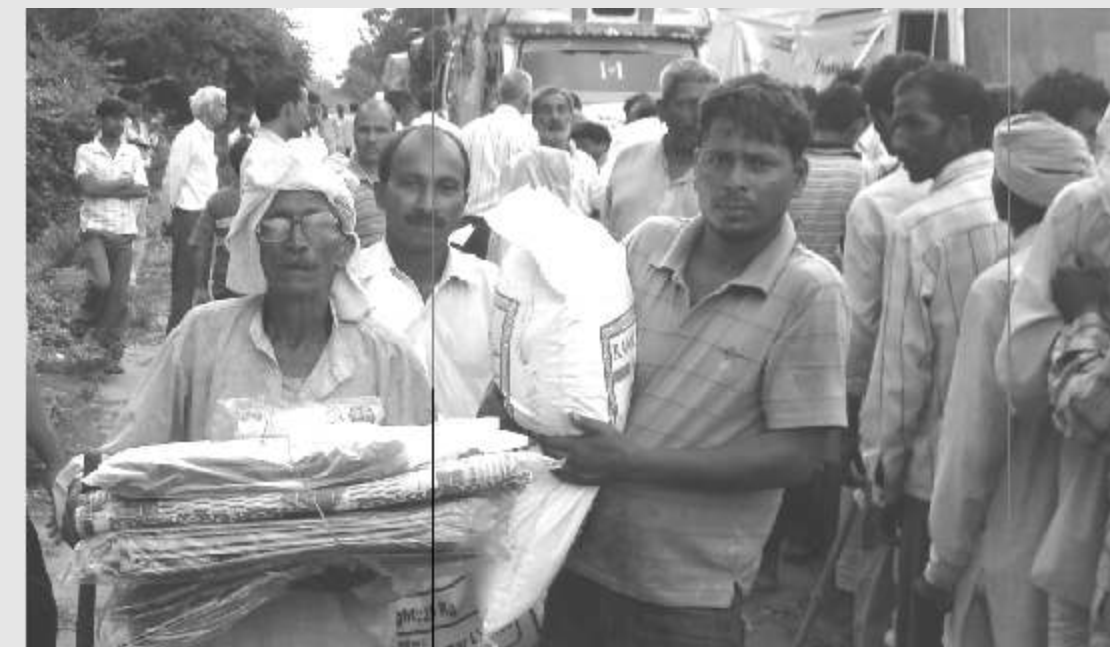
An elderly victim of the flood receives his ration and shelter material.

More than 30 districts in Uttar Pradesh (UP) faced severe flooding. According to Govt. officials, the death toll in rain-related incidents had gone up to 256. Swirling waters of UP's major rivers have inundated 177 villages in many districts. The flood situation in 9 districts of Western UP badly affected road and rail traffic.