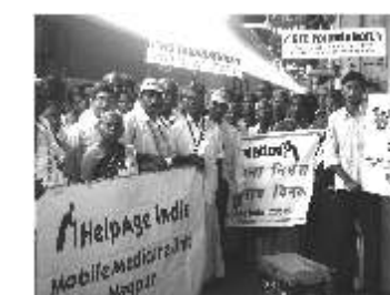
Elders at Nagpur station as they journey their way to Delhi from Cuddalore (TN)

In a move displaying determination and empowerment, 800 elders from remote areas in Tamil Nadu & Kerala, travelled more than 2000 Kms all the way to the national capital, in a special train starting from Cuddalore (TN). They came to put forth their demand for a National Commission for the Aged on International Day of Older Persons, October 1, 2008. It was a part of their Memorandum of Demands which they handed over to Mr. Rahul Gandhi, General Secretary of the Indian National Congress and Member of Parliament and Mr. P. Chidambaram, Home Affairs Minister. A copy of the Memorandum was also handed over to Ms. Vasanthi Stanley, Member of Parliament. Most of the elderly were representatives of Elder Self Help Groups affected by the devastating Tsunami of 2004. They came together and federated at the village & district levels and registered themselves as Elders for Elders Foundation with support from HelpAge. Events took place nationwide to mark the day, strengthening the power of seniors.