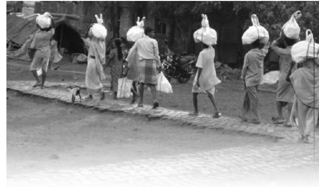
Beneficiaries carry HelpAge relief material distributed in Midnapore district, West Bengal, which faced heavy damage caused by flash floods due to incessant rainfall in June 2008, affecting more than a lakh of people in the district.

through knee deep water venturing into areas completely inaccessible by transport on foot, providing much needed relief to the victims.