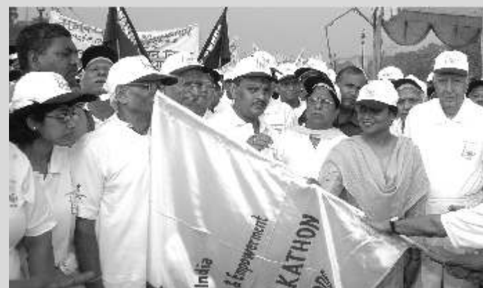
Ms. Meira Kumar, then Union Minister for Social Justice and Empowerment flags the intergenerational walk at Rajpath, Delhi. Over 300 school children along with 2500 senior citizens marched together emphasizing the importance of intergenerational bonding on Oct. 1, International Day of Older Persons 2008. Nationwide similar walks were organized and fresh impetus was given to the existing healthcare programme for the elderly.