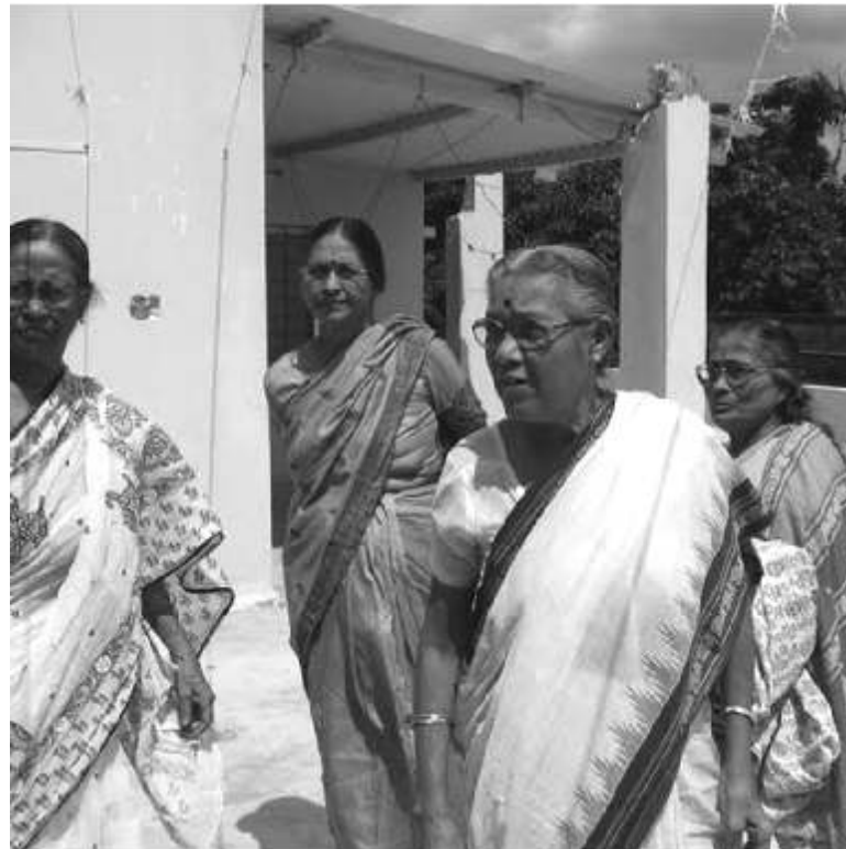
Residents of Kalyan Ashram take a stroll on the rooftop of the home

The two storey building has been converted into a modern day home for elderly women with all the facilities of a library, physio care services and round-the-clock access to a doctor apart from weekly health check-ups through the MMU service. For the HelpAge staff members the residents of the Ashram are family. Together the staff and residents mark special days like birthdays, festivals, anniversaries etc.