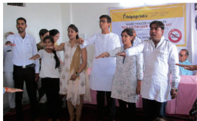
Youngsters pledge their support in the Fight against Elder Abuse in Lucknow