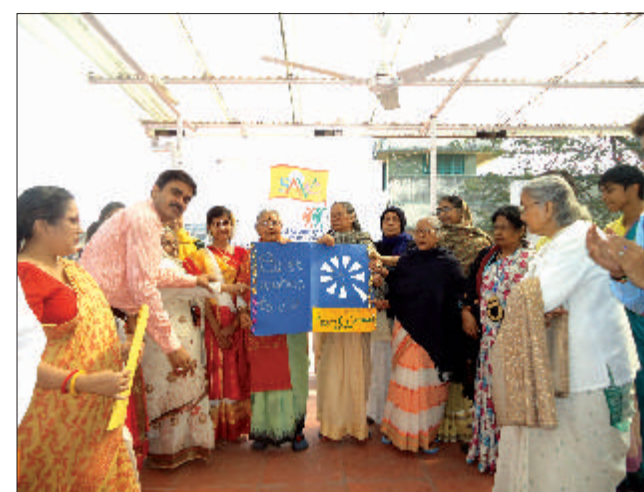
The Mashimas as the students of South City International School, Kolkata, fondly call the residents of Kalyan Ashram in Kolkata, proudly hold up the big hand-made card scattered with signatures of all the students who visited them for a day of dancing, singing and merry-making. A day filled with love & laughter the Mashimas would remember for a long time.

HelpAge's SAVE - Student Action for Value Education programme encourages school children to treat their elderly with love and care and understand their issues in-depth. The programme is gaining strength everyday as more and more schools and students are joining hands with HelpAge to support the cause of the elderly.