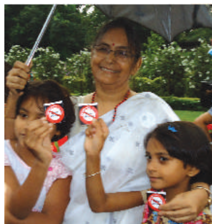
Grandchildren stand proudly with their grandmother & show their support in the fight against Elder Abuse at Mohor Kunja, Kolkata.