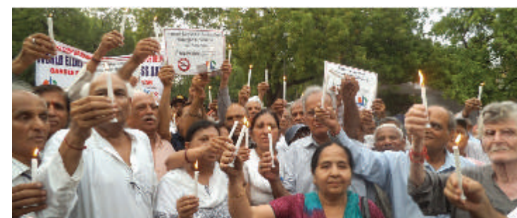
Nearly 300 senior citizens assemble in the national capital at Jantar Mantar showing their support for the fight against Elder abuse through a candle light march.