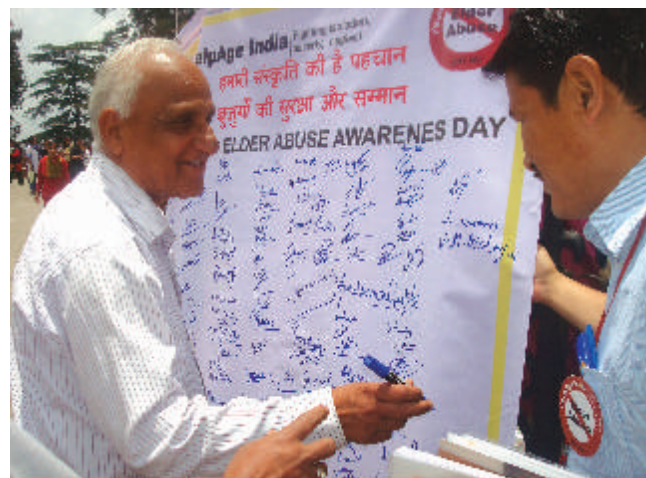
An elderly man signs on his support at the Ridge Shimla.