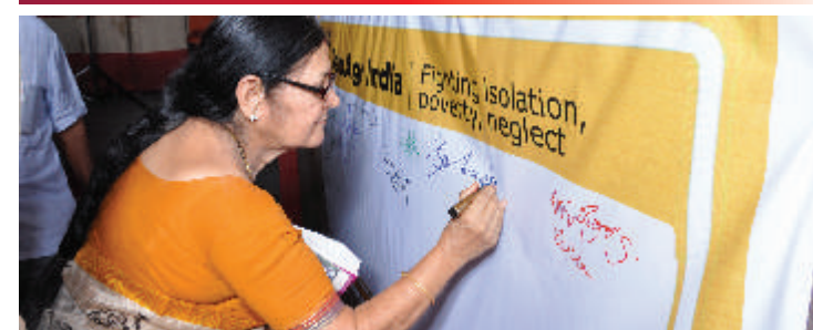
An elderly woman signs on her support for the fight against Elder Abuse in Hyderabad