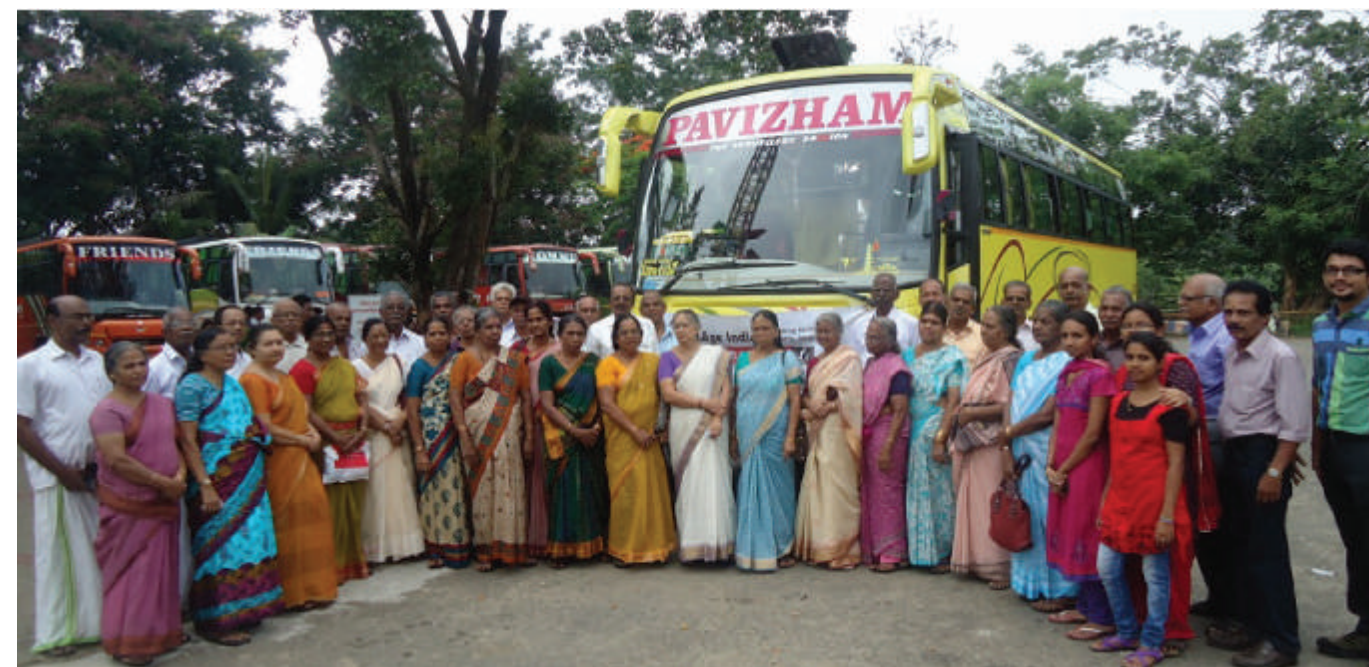
Senior citizens of Kochi revisit their school days during a fun day trip organized by the HelpAge Kochi team, in association with Senior Citizen Friends Welfare Association, Palluruthy, to various historical and touristic sites in Kerala such as Athirappilly, Vazhachal Waterfalls and Sree Sankaracharya Stupam at Kalady. The group of 44 members enjoyed themselves thoroughly during this trip down memory lane.