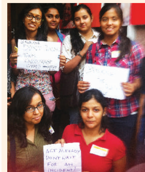
Young volunteers at HelpAge India showed their support in the fight against Elder Abuse by spreading the message with simple placards and through Social Media.