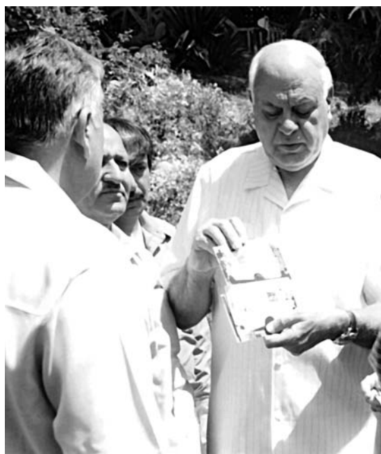
Dr. Farooq Abdullah, MP - Rajya Sabha, displays the photographs of the MMU donated by him to HelpAge under the MPLAD scheme. This vehicle will replace the old one based in Jammu.