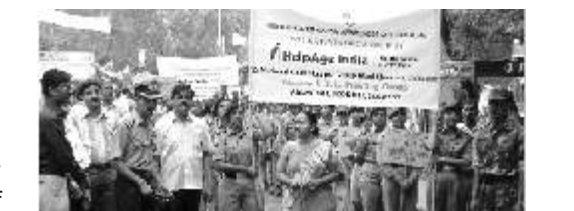
Walkathon in Lucknow with NCC cadets.