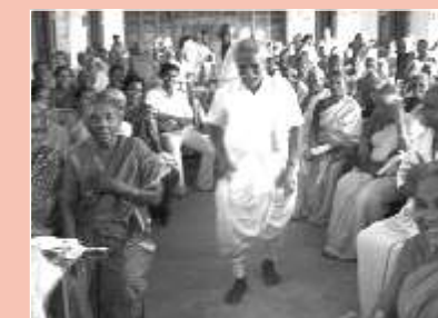
In the coastal district of Tamil Nadu a rising number in elderly are suffering from Osteoarthritis, severely curbing mobility and making them dependent. HelpAge organized a special camp at the district of Nagapattinam for such elderly, providing them with "knee braces". Nearly 200 beneficiaries benefited from the camp and now look forward to this new lease of life.