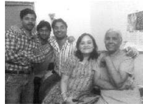
Young team members of Convergys share a light moment with an elderly resident of St. Mary's home for the Aged.