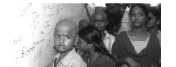
Children sign on the 100-foot canvas in Chennai.