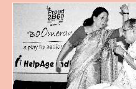
Me too! : A scene from "Boomerang", a comic play scripted, directed and enacted by senior citizens of varying ages from 65 to 90, as part of HelpAge's Proud2B60 campaign in India's 60th year of Independence. The campaign tagline "Who are you calling old?" seeks to bust age-related myths, and portray the aged in modern-day India as active, healthy and contributing to society.