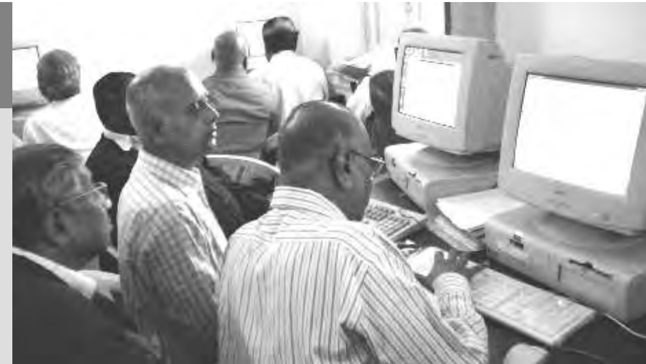
Elders get techno savvy as they hone their computer skills at the day care centre supported by HelpAge India in Bengaluru.

Over 100 elders have been trained and it has given most of them an independence and self confidence hard to measure. They use their skills to send letters to their loved ones settled abroad or outside the city, without the long wait of postal service. Many are using their computer literate skills to organize their accounts through the accounting software also available for training. Some have even got jobs at private companies and are no longer dependent on any one for their daily needs.