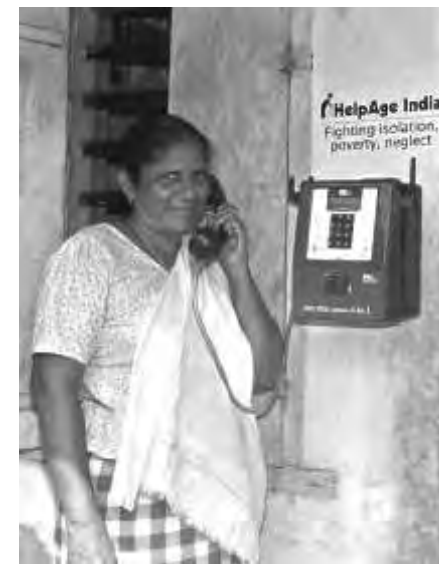
An elderly lady makes a call through the Helpline.

The telephone numbers are networked with the common elderly Helpline number. Village Level Federations manage these Helplines and it also serves as a meeting point for village elders.