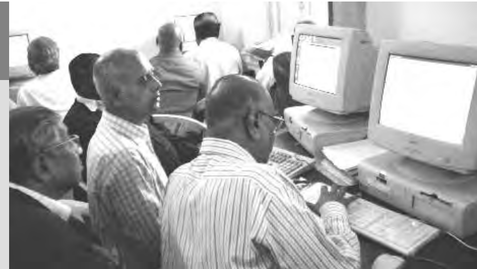
Elderly get techno savvy as they hone their computer skills at the day care centre supported by HelpAge India in Bengaluru.

Over 100 elders have been trained and it has given most of them an independence and self confidence hard to measure. They use their skills to send letters to their loved ones settled abroad or outside the city, without the long wait of postal service. Many are using their computer literate skills to organize their accounts through the accounting software also available for training. Some have even got jobs at private companies and are no longer dependent on any one for their daily needs.