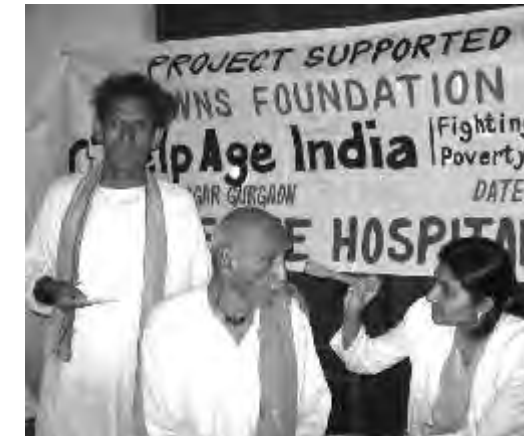
A doctor examines an elderly patient for cataract, at the free eye camp for elderly in Gurgaon (Haryana) supported by WNS Mumbai and organized by HelpAge India in coordination with ICARE Eye Hospital (NOIDA). 100 older people underwent surgery and found a new lease of life. WNS has been a long time supporter of the cause and has over the years been dedicated towards Corporate Social Responsibility. It has donated Rs.7 lakh for conducting 700 eye surgeries.