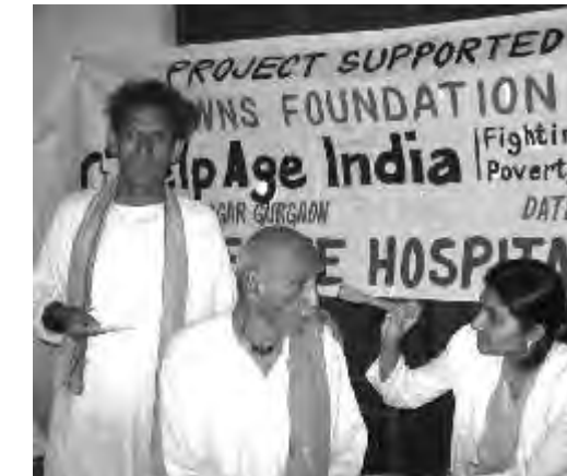
A doctor examines an elderly patient for cataract, at the free eye camp for elderly in Gurgaon (Haryana) supported by WNS Mumbai and organized by HelpAge India in coordination with ICARE Eye Hospital (NOIDA). 100 older people underwent surgery and found a new lease of life. WNS has been a long time supporter of the cause and has over the years been dedicated towards Corporate Social Responsibility. It has donated Rs.7 lakh for conducting 700 eye surgeries.