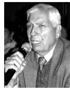
A representative of the Senior Citizens' Forum, Tagore Garden, raises the issue of the need for developing avenues for utilization of Older Persons' Skills for social development, at the seminar on "Advocacy for Rights of Older Persons: Challenges for Building Capacity" organized by HelpAge India.