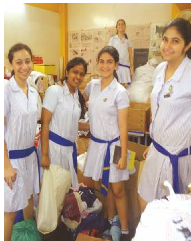
Students of J.B. Petit High School for Girls, Fort, Mumbai (Maharashtra) get ready to distribute ration and clothing to needy elderly.