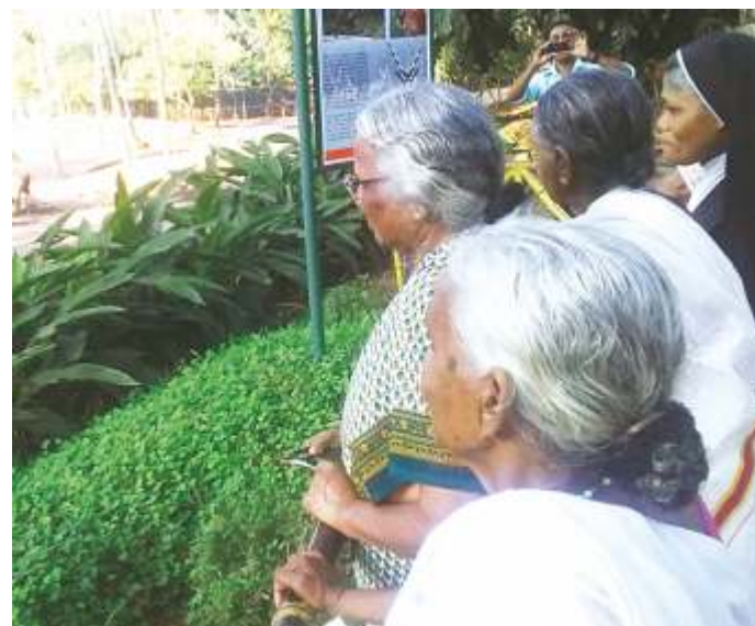
Elders from Muthunayagam Home for the Aged, Plamoodu, Pattom, Trivandrum (Kerala), unwind & enjoy their trip to the Trivandrum zoo. This trip was a part of a picnic tour organized for them to places such as Kochuveli Lake and beach, Vettukad Church and Trivandrum airport along with the zoo.