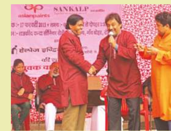
Public health issues of senior citizens being showcased by Nukkad Natak team 'Kala Sagar' during a free special health camp organized by HelpAge India at Village Bohar, Rohtak (Haryana) supported by Asian Paints, Rohtak (Haryana), HelpAge India with the support of Asian Paints organized two such camps in the villages of Rohtak district (Haryana) benefitting 900 elderly.