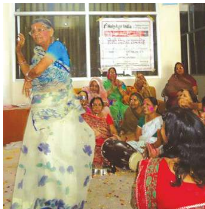
Elderly women have a field day at Shri Krishna Dham (old age home), Vidhyadhar Nagar, Jaipur (Rajasthan), marking 'Holi' - the festival of colours. They rejoiced, danced, sang devotional songs and put colour on each other, celebrating the spirit of the festival.