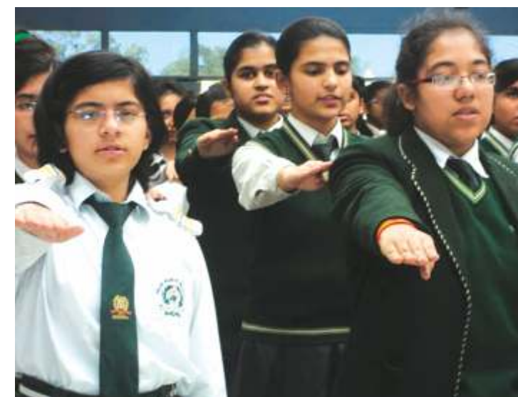
Students of Delhi Public School, Bhopal (MP), pledge to care for and support the elderly. They also distributed blankets to the needy elderly under HelpAge's SAVE program.