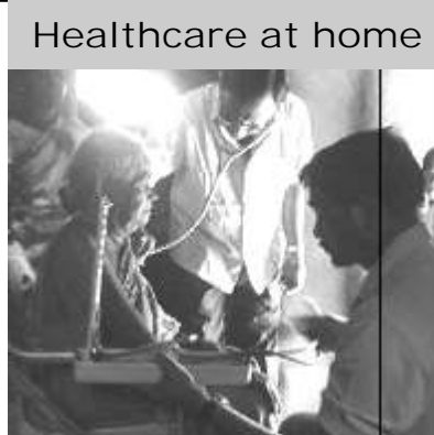
Healthcare at home

The MMU team of Rajgangpur (Odisha) treat a destitute elderly woman during a Home visit. Unable to access any medical facility due to physical immobility, many elderly often are often bereft of any medical treatment, especially in small towns and rural areas. For such elderly in many cases, the HelpAge MMU team visits their homes and provides on-the-spot treatment to the destitute elder.