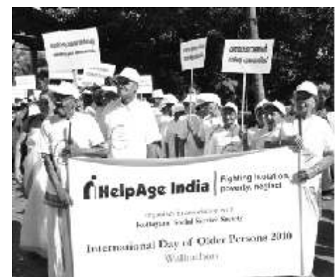
Senior citizens march together in step to drive home the point of the importance of healthy ageing in Kottayam (Kerala).