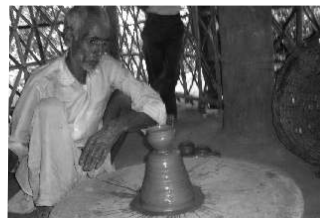
An elderly potter works hard at the wheel in Kalagram, a place for artists, constructed to support the livelihood of local aged artisans at the Vishokanand Vriddh Ashram in Ganj, Bijnor (UP).

The Vishokanand Vriddh Ashram is a unique haven for the aged of Bijnor (UP). Run by HelpAge, it caters to multiple needs of the elderly of Bijnor, by providing healthcare through its Rural Health Centre for the aged, based on the traditional system of Indian medicines viz. Ayurveda, Homeopathy & Naturopathy. It also provides Physiotherapy and Livelihood opportunities, along with helping them fulfill some of their long cherished dreams of travel by organizing tours to places of worship and of historical significance.