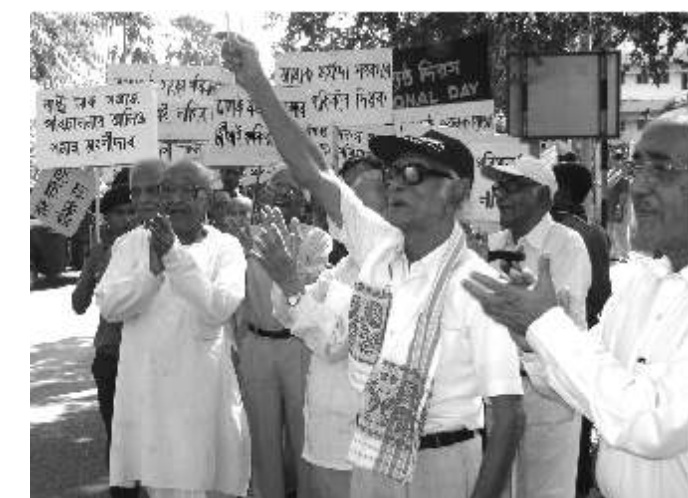
Senior citizens of Assam participate in a mass procession demanding their rights on International Day of Older Persons. Over 300 people took part in the march. The Assam Senior Citizens Association, the Pensioners Associations, State Bank Pensioners Associations and ONGC Pensioners Associations, joined hands with HelpAge to observe the day.