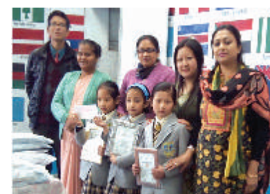
Students who gathered the highest contribution towards the cause of the elderly in their school, proudly pose with their special certificates at the cheque handing