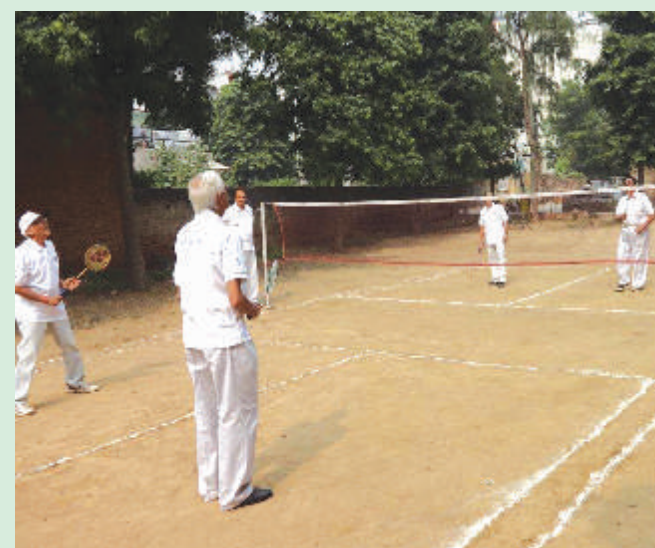
Senior Citizens enjoy a game of Badminton.

Enlistment for the Badminton Club was the most interesting part. Even though every member remembered and reminisced having shaken a Badminton racket or two in their heydays, many of them felt that they were neither in an age, nor in any state physically as some had aids such as walking sticks, artificial limb etc. and nor did they have any