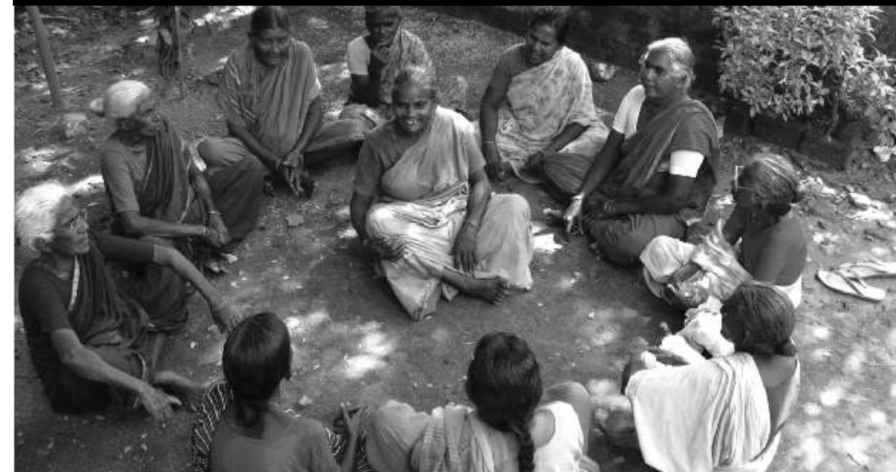
Rural women members of the Kranthik Elders Self Help Group, discuss the group's activities at Nalakinta, Vijayawada (AP). In an effort to urge elderly to become independent and economically secure, HelpAge's Support a Gran project in Andhra Pradesh (AP), has formed 95 Elder Self Help Groups which have started thrift and also internal lending for their Income generation activities like chicken rearing, vegetable vending, etc.