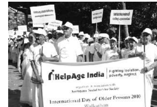
Senior citizens march together in step, to drive home the point of the importance of healthy ageing in Kottayam.