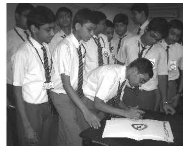
Senior students of Shri Daulatram Nopany Vidyalaya, Kolkata, take part in the signature campaign against Elder Abuse.