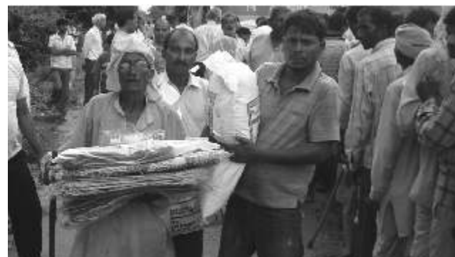
An elderly victim of the flood collects HelpAge relief material to get through his daily needs.

community has also provided 3.75 acres of land on a 30 year lease to HelpAge for establishing a special 'Elders Village'.