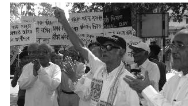
Senior Citizens of Guwahati participate in a march, demanding their rights for a better quality of life.