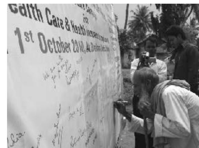
An elderly man signs his support during the signature campaign in Dist. Cuttack.