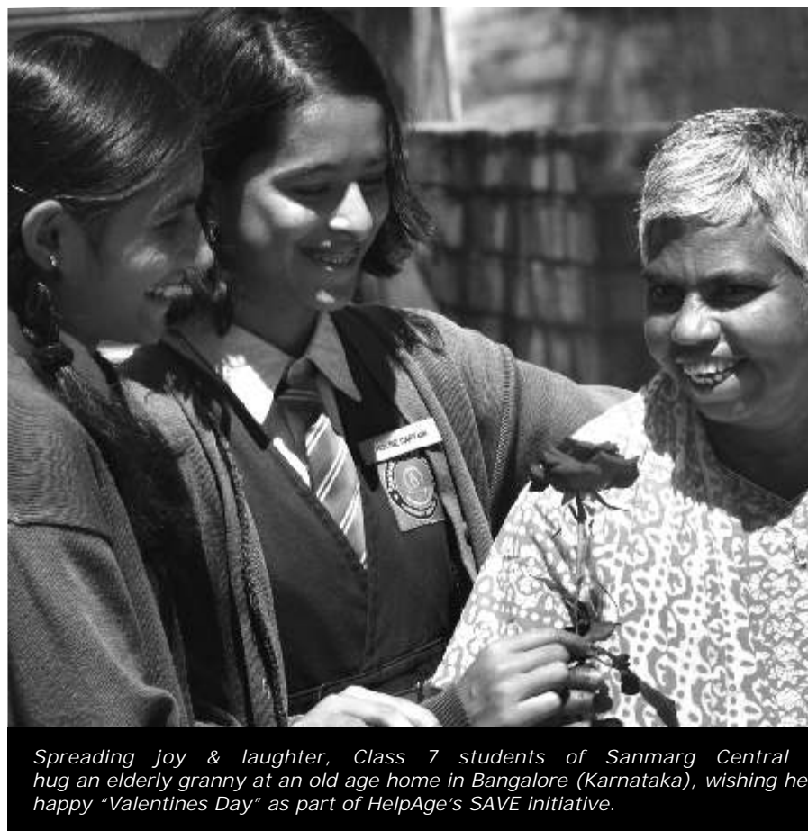
Spreading joy & laughter, Class 7 students of Sanmarg Central S hug an elderly granny at an old age home in Bangalore (Karnataka), wishing her happy "Valentines Day" as part of HelpAge's SAVE initiative.

and Principals across the nation, bringing home the point of the importance of value education in today's school curriculum through Principal Meets organised in Delhi, Karnataka, Kerala, Andhra Pradesh, Odisha, Madhya Pradesh, Tamil Nadu, Maharashtra & Gujarat etc, mostly presided over by Principal Secretaries, Directors of Education and eminent personalities from the field of education.