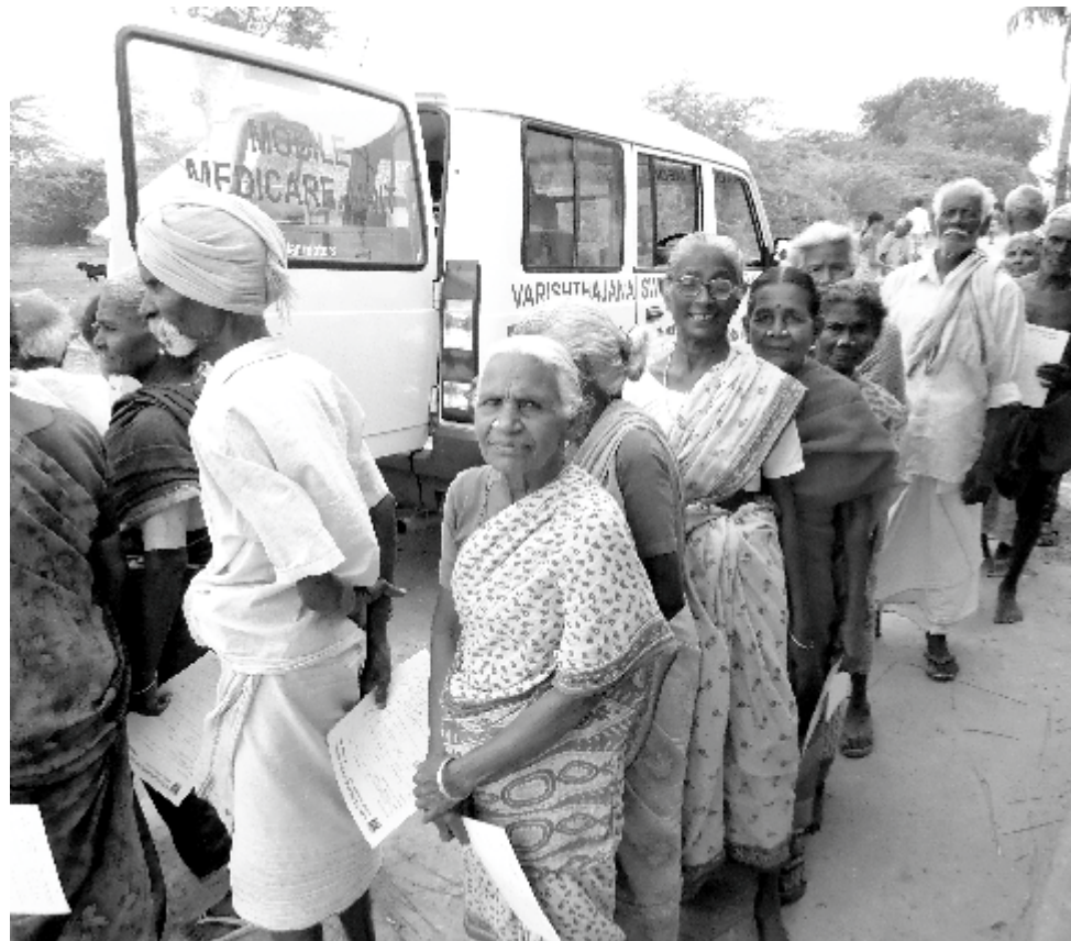
Elderly line up for their medicine & treatment at a village in Nagapattinam (Tamil Nadu).