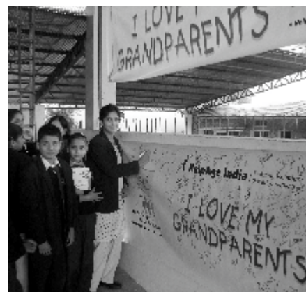
Students of GRD Academy, Dehradun (Uttarakhand) pledge their love and support to their grandparents through a signature drive.