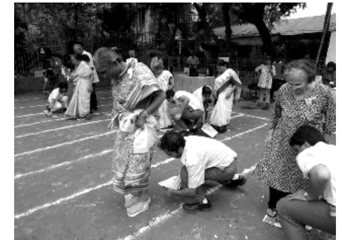
Kolkata's Grannies take part in the Newspaper race along with students on IDOP during the "Grannies Sports Day" organized by HelpAge. 70 students from various city schools like Lakshmi Pat Singhania Academy & South City International School and 60 grannies from old age homes participated in the event at Chetla Central Park, Kolkata. Participating in various games got the elderly excited and swinging in action forcing the young to match upto them.