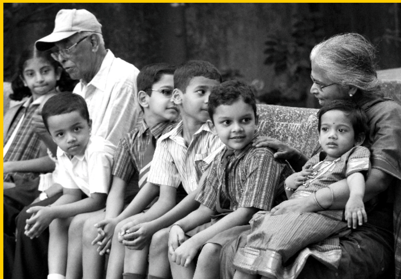
Children and elderly share fun moments with each other at a park in Mumbai (Maharashtra).

HelpAge's Student Action for Value Education (SAVE) initiative is rapidly gaining momentum and working its way through schools across India from Leh to Kanyakumari and Maharashtra to Arunachal Pradesh, sensitizing school children, urging them to support their elders and understand their needs. More than 1500 schools have come forward and shown their support to this programme and nearly 10 lakh students have pledged their support to the cause.