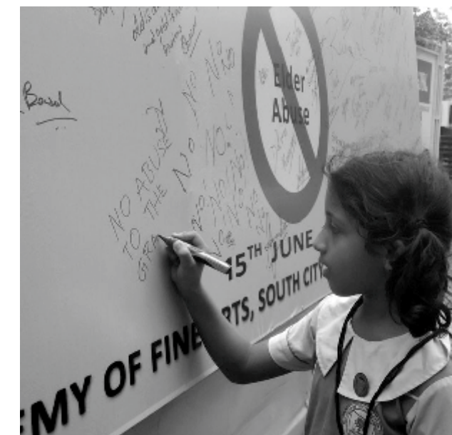
A young student from St. John's Diocesan Girls Higher Secondary School, Kolkata, signs her support in the 'Fight Against Elder Abuse'.