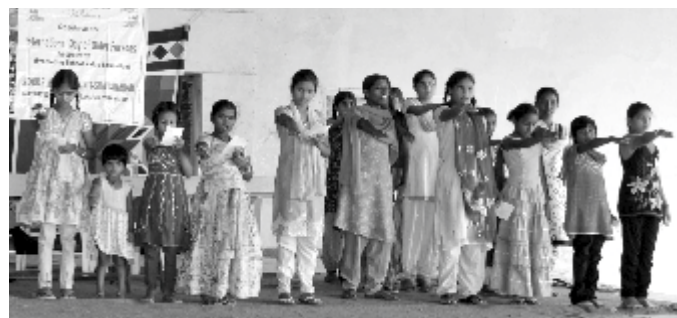
Students of Govt. Primary School of Shamshabad Mandal, Ranga Reddy District, take the SAVE pledge on IDOP in Shamshabad (AP), promising their support towards the elderly.