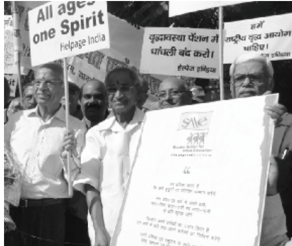
Senior citizens of Lucknow, spread the message of 'All Ages, One Spirit' and the importance of inculcating right values in children at a young age, by supporting HelpAge's SAVE initiative during a walkathon marking IDOP.

In Chandigarh, and Bhopal (MP) & Bengaluru (Karnataka), senior citizens, students, educationists & eminent citizens pledged their support to the cause of the elderly. In Guwahati, (Assam), Panaji (Goa), Hyderabad (AP) and Shimla (HP) walkathons were the medium to spread awareness about the growing need for value education. Students, teachers, principals & senior citizens participated in signature campaigns on the eve of IDOP in Bhubaneswar, (Odisha) Raigarh (Chhattisgarh) and Jaipur (Rajasthan). Cultural programs and competitions emphasized the message of inter-generational bonding in Dehradun (Uttarakhand), Jammu (J&K), Ahmedabad (Gujarat) and Thiruvananthapuram (Kerala).