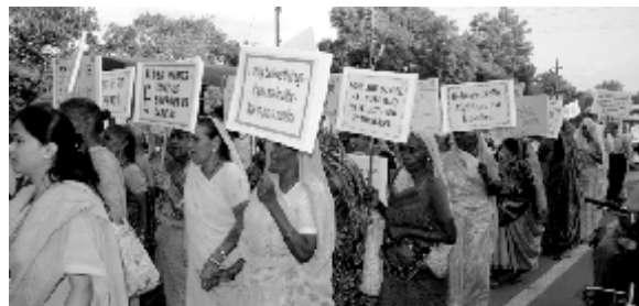
Elderly in Bhopal walk hand in hand to raise awareness on issues of the elderly on IDOP.