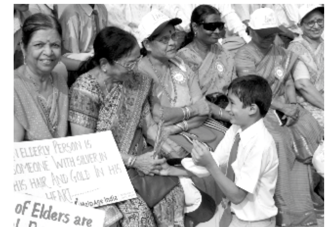
A student greets an elderly lady before the inter-generational walkathon on the IDOP in Mumbai. 400 school children, senior citizens, beneficiaries, volunteers from colleges and corporate representatives, took part in the event which culminated with HelpAge honouring elderly who have made a difference in the lives of others.